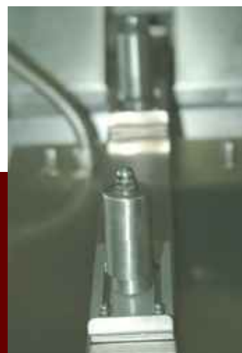
Pressure control Maximum